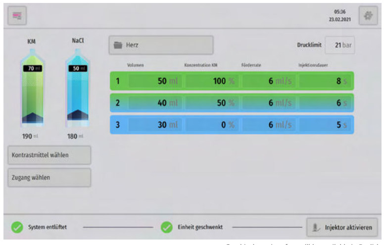
Graphical user interface will be available in English once Accutron® CT-D Vision is commercially available.