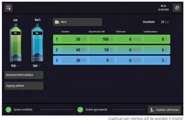
once Accutron® CT-D Vision is commercially available.

Inside the exam room, the choice of the light mode display on the injector screen enhances the readability of key parameters. In the low light of the console room, the operator can choose the dark mode display to reduce visual disturbances and allow the focus on the imaging procedure.